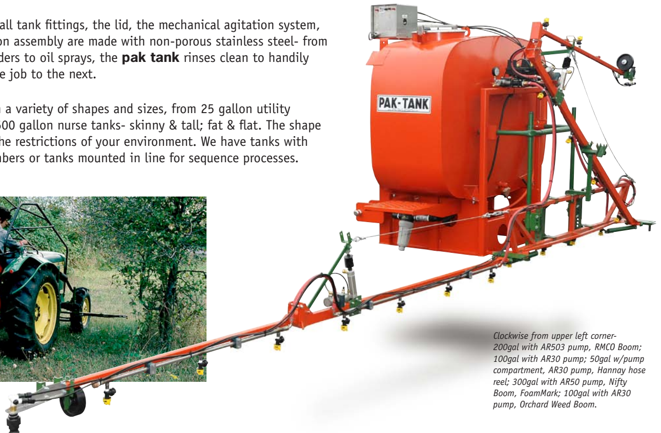
Clockwise from upper left corner- 200gal with AR503 pump, RMCO Boom; 100gal with AR30 pump; 50gal w/pump compartment, AR30 pump, Hannay hose reel; 300gal with AR50 pump, Nifty Boom, FoamMark; 100gal with AR30 pump, Orchard Weed Boom.