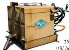
1960s... still hard at work

Dial 1.800.547.8925 or 541.688.1002 if you're a neighbor.